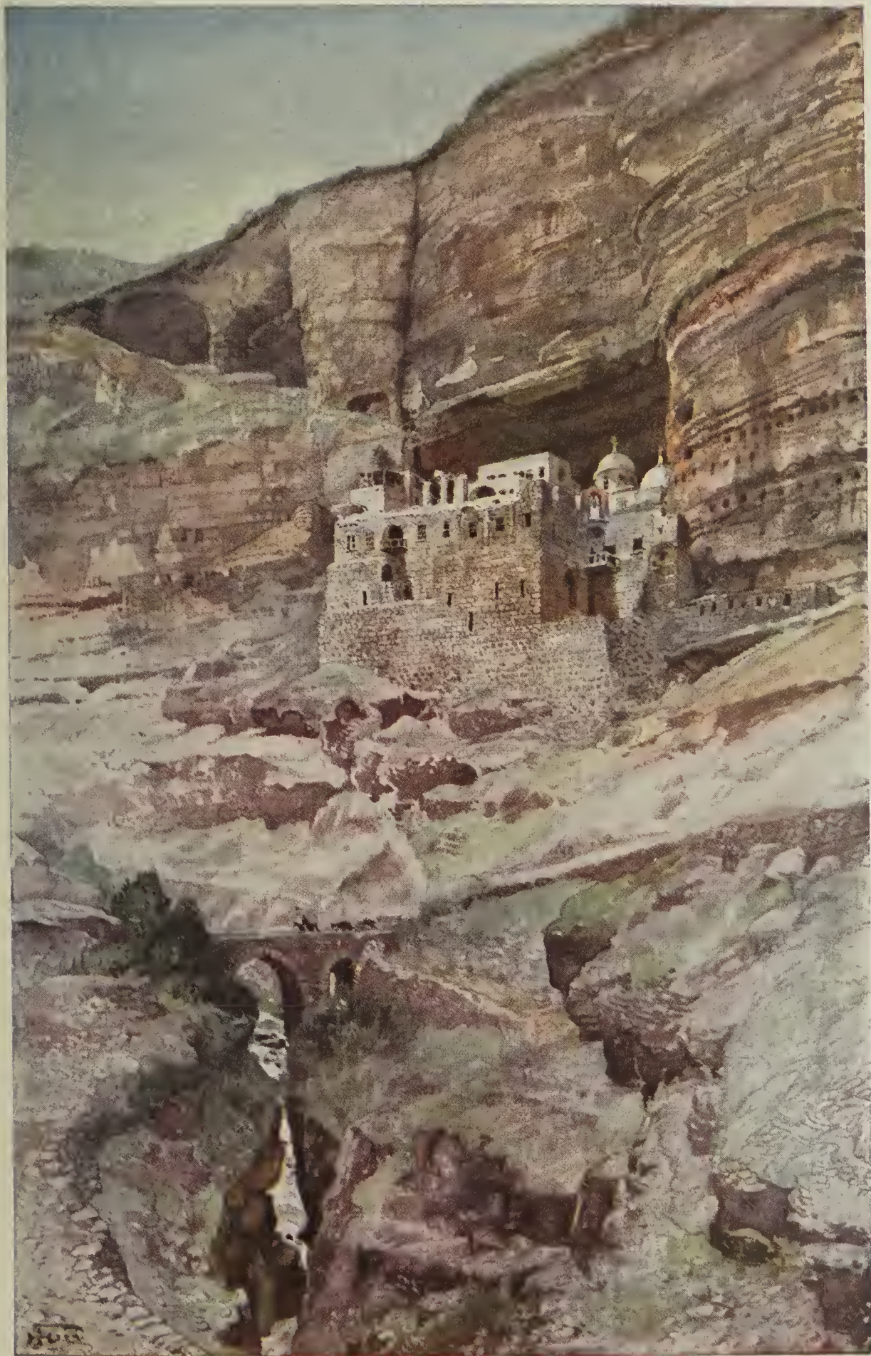
Great Monastery of St. George.